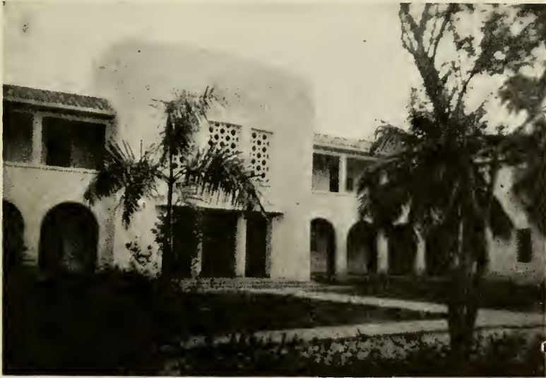
New building at George O. Robinson School, Santurce, Puerto Rico